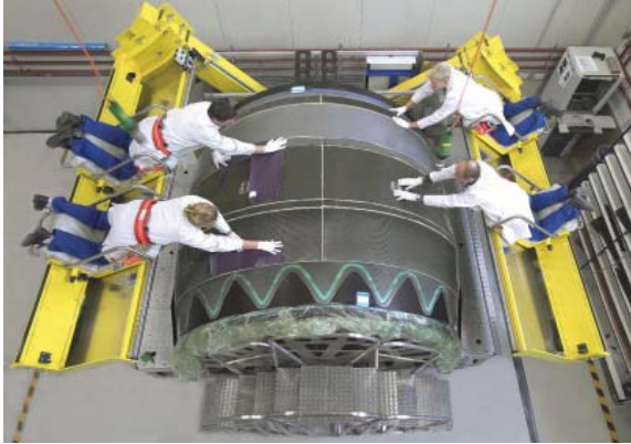
Austria-based Fischer Advanced Composite Components AG (FACC) is a leading company specializing in the development, design and manufacture of composite components and systems for civil aircraft. Shown are technicians laying up composite material on a tool used to create translating sleeves for the Boeing 787 Dreamliner.

Fischer Advanced Composite Components AG (FACC), located in Austria, is a leader in designing and manufacturing aircraft components and systems. It supplies products made of ultra-strong carbon fiber composite materials for modern civil aircraft, and was charged with designing and delivering advanced composite translating sleeves for the exciting, new Boeing 787 Dreamliner commercial airliner.